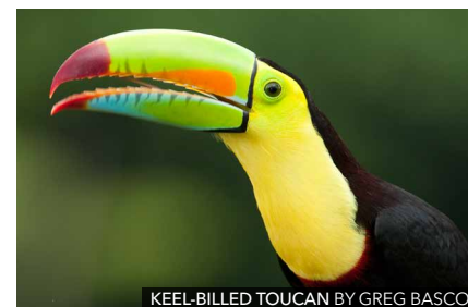
KEEL-BILLED TOUCAN BY GREG BASCO