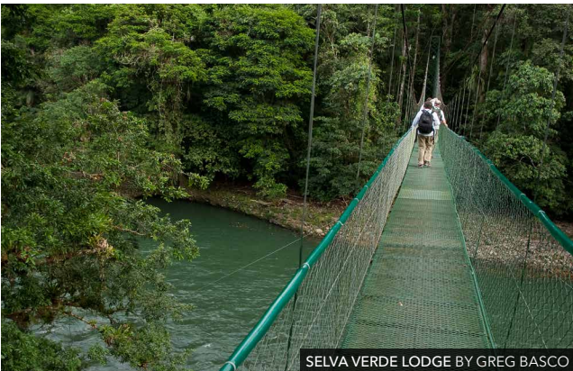
SELVA VERDE LODGE BY GREG BASCO

Upon arrival at the airport in San José, you will be met by your local guide and transferred to the hotel. Overnight at Hotel Bouganvillea.