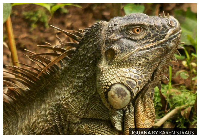
IGUANA

scholarship funds for high school students. Join a local community member at the SCLC to experience cooking a traditional Costa Rican dish for lunch. This afternoon, visit a working chocolate farm on the nearby Tirimbina Reserve. During this hands-on experience, learn how ancestral indigenous traditions tie in with modern commercial needs and discuss the sustainability of commercial crops—particularly chocolate, which requires shade to grow. Moreover, gain a deeper understanding about the importance of incorporating humankind into the conservation landscape, and the aim of creating sustainable livelihoods as a part of environmental initiatives. Return to the lodge for dinner. This evening, enjoy a lecture on the importance of Selva Verde in the creation of a biological corridor between Braulio Carrillo National Park and the Caribbean coast. This lecture will highlight the plants and animals found in and associated with the rainforest at Selva Verde. Overnight at Selva Verde Lodge & Rainforest Reserve. (BLD)