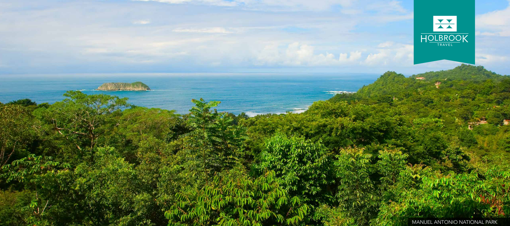
MANUEL ANTONIO NATIONAL PARK